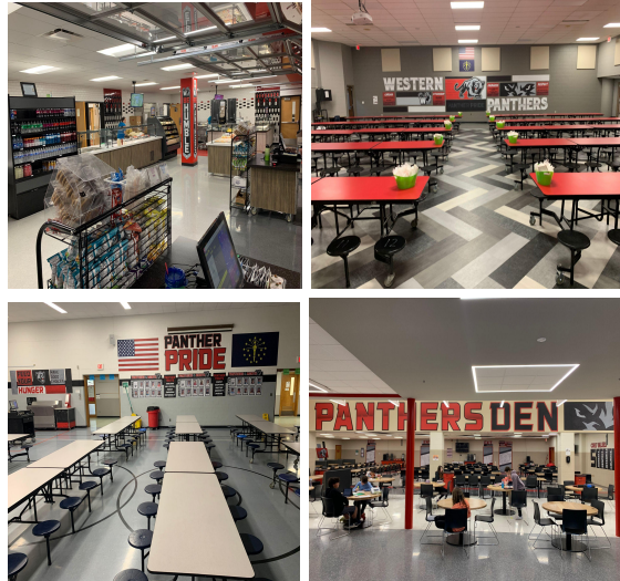
(Top L-R) WHS Cafe, WPS Cafe (Bottom L-R) WIS Cafe, WMS Cafe